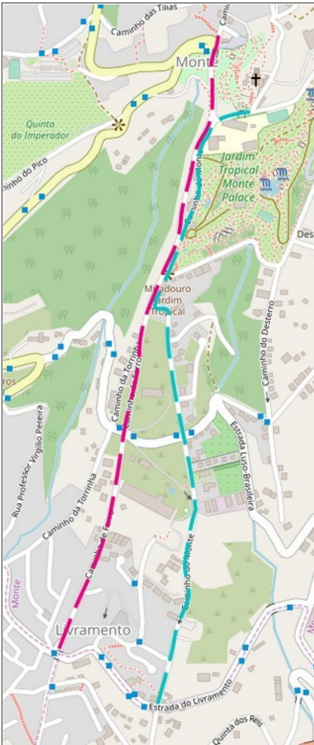
Monte to Livramento ..