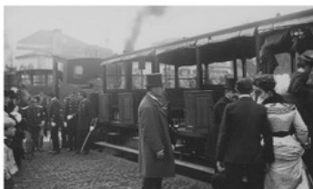
VIP's boarding at the front of the carriage.