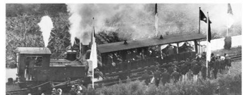
Ready to depart.