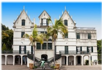
Originally called Quinta do Prazer, then became the Monte Palace Hotel.