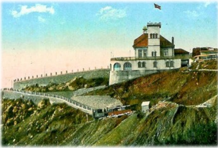
Terreiro da Luta, Chalet Restaurant-Esplanade.