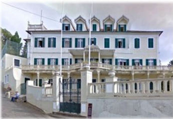
Originally Quinta Bello Monte and later became the Grande Hotel Belmonte. (this photo as 2020)