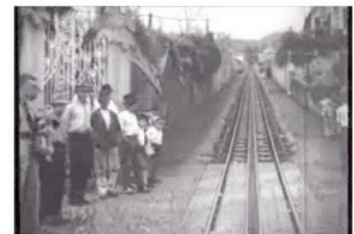
Crossing at Santa Luzia, clearly identified by the gate on the left corner still existing in 2020. Photo likely taken by someone on the train as it waited at the stop.