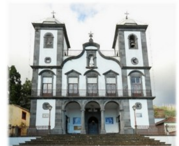
Church - Nossa Senhora do Monte (Our Lady of the Mountain)

Upper section of line continued from previous page.