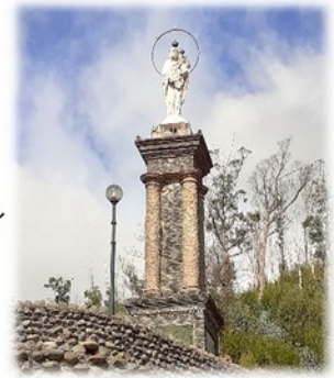
Statue - Nossa Senhora da Paz (Our Lady of Peace)