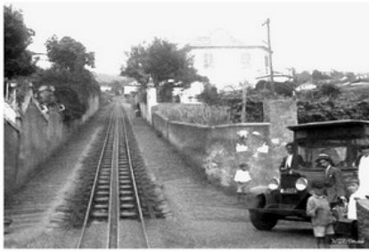
Probably the Caminho da Portada de Santa Antonio crossing and the Flamengo stop. The house in the photo has an entrance at the white posts on the right of the track and a main entrance by the car. Both can still be seen in 2020.