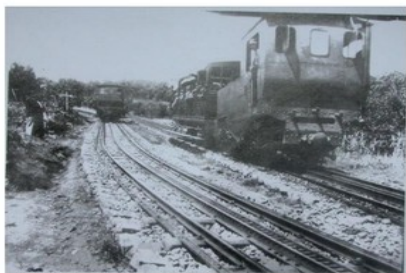
This shows the passing loop at Livramento. The one other similar loop was at the Monte station.