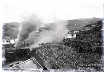
On the way to Monte.