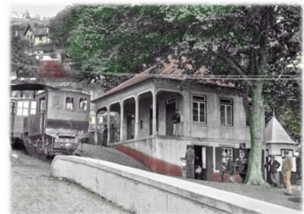
The Monte Station - built between 1911-1912 as part of the extension to Terreiro da Luta.