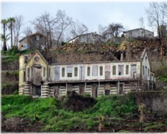
Quinta das Tílias, became Hotel Mount Royal, later destroyed by fire.