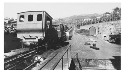
Train at the Pombal station waiting for passengers.

Lower section of the line to Confeiteira. The upper section is on the following page.