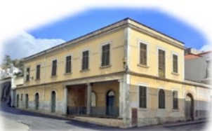
The station as it appears in 2020.